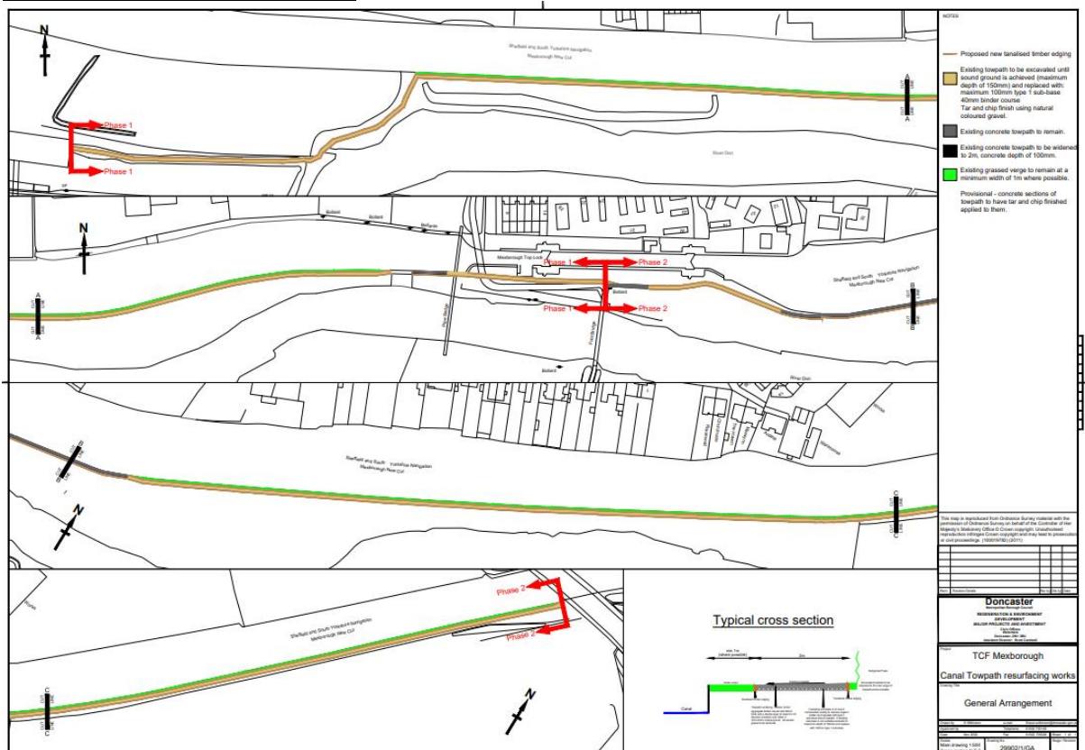
Figure 1 – Location of route

The Mexborough scheme comprises pedestrian / cycle improvements on a route adjacent to the canal between Mexborough railway station and Dearne Valley Leisure Centre / Denaby Main to the east, and between the northern residential areas of Mexborough and the Transpennine Trail on Mill Lane. The canal route will provide a connection towards the Conisbrough scheme that forms part of the Station Access package.